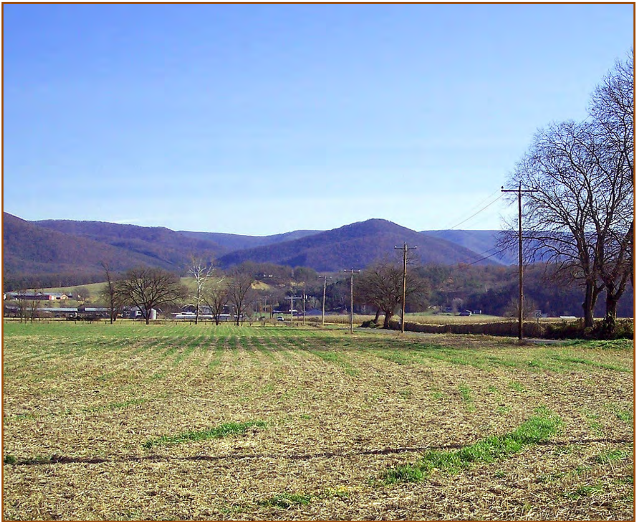
Figure 5: Although residential and commercial development is occurring around the town of Moorefield, the northern portion of the Moorefield battlefield remains in agricultural use. Photo by Joseph E. Brent, 2007.