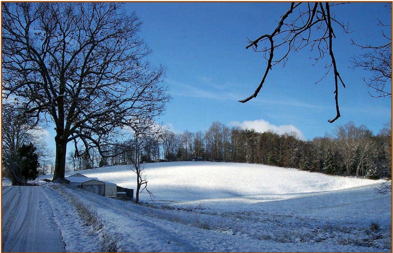
Figure 3: An unprotected portion of the Carnifex Ferry battlefield. Residential develop has begun on adjacent parcels. Photo by Joseph E. Brent, 2007.