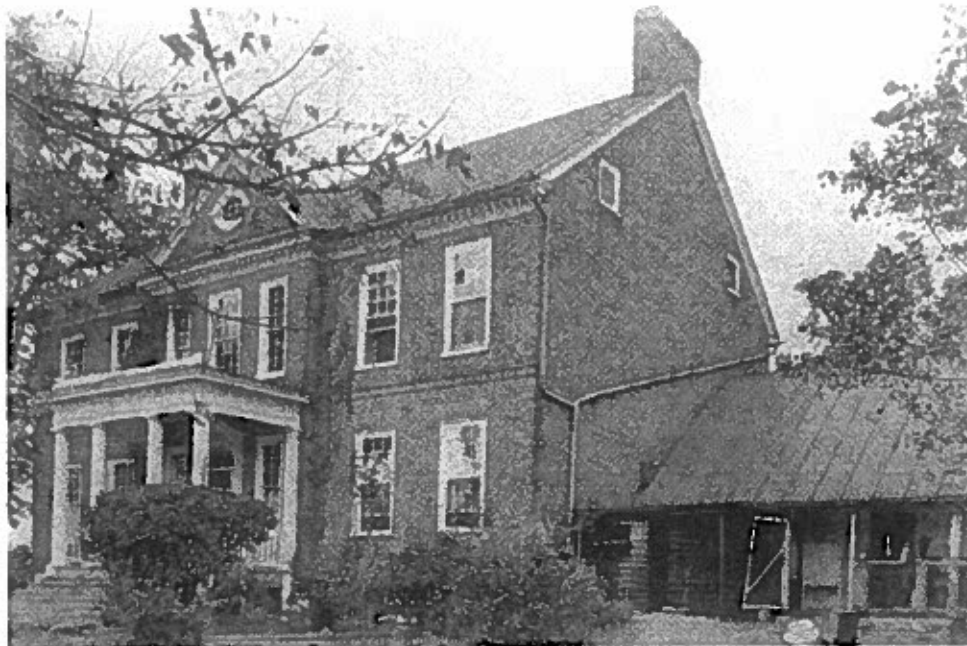
The property as it appeared when photographed in 1937

SITE # Jefferson County 2004-2005 Survey No. 317