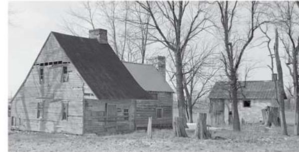
1933 Photos of the Peter Burr House from the Historic American Building Survey

The barn that is presently on the property is a reconstruction of the type of barn that likely existed here in the late 18th century. The four crib log barn is a type that has been documented in the Cumberland Valley, and has a steep-pitched wool shingled roof with vertical siding and dirt floors. This reconstruction style is favored because the barn was likely quickly built upon the Burr's arrival on the land out of logs.