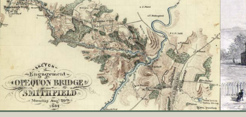
"Sketch of Engagement at Opequon Bridge and Smithfield," by Union cartographer Jedediah Hotchkiss.