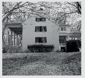
Falling Springs, ca. 1837, as seen from the west looking east.

These four homes, in the historic district, are privately owned and cannot be seen from a public road.