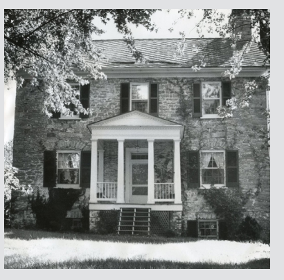
Springdale, ca. 1760.

Beeline March in 1775. The Old Stone House was the site of the barbecue 50 years later in 1825.