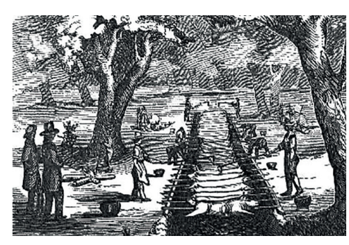
More than 5,000 persons attended the barbecue.