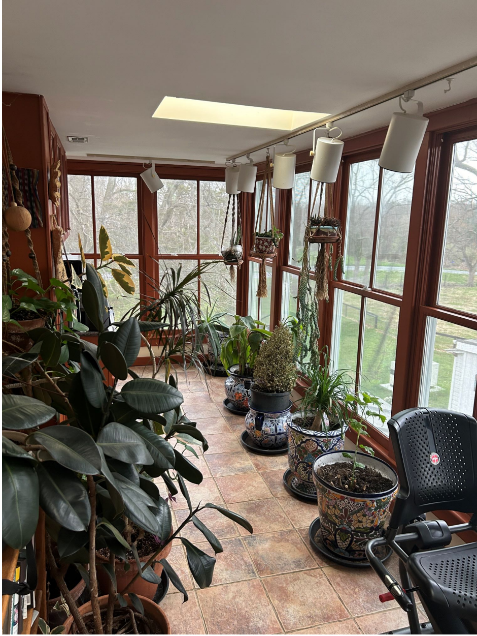
Sun room (converted sleeping porch) facing north.