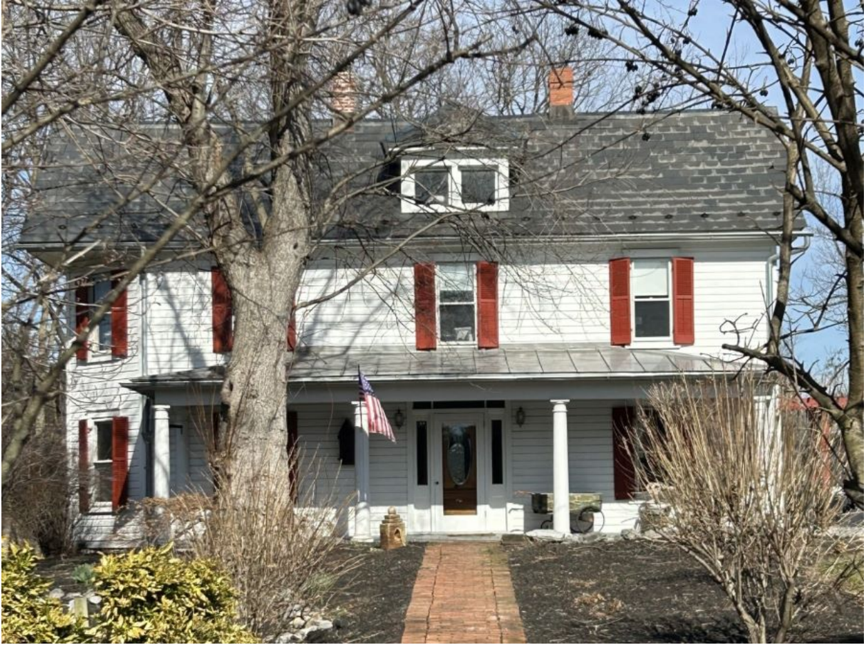
Front view of Shenandoah Oaks.