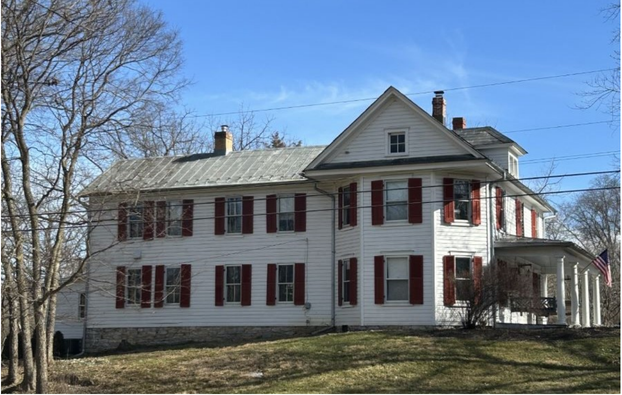
Shenandoah Oaks west façade.