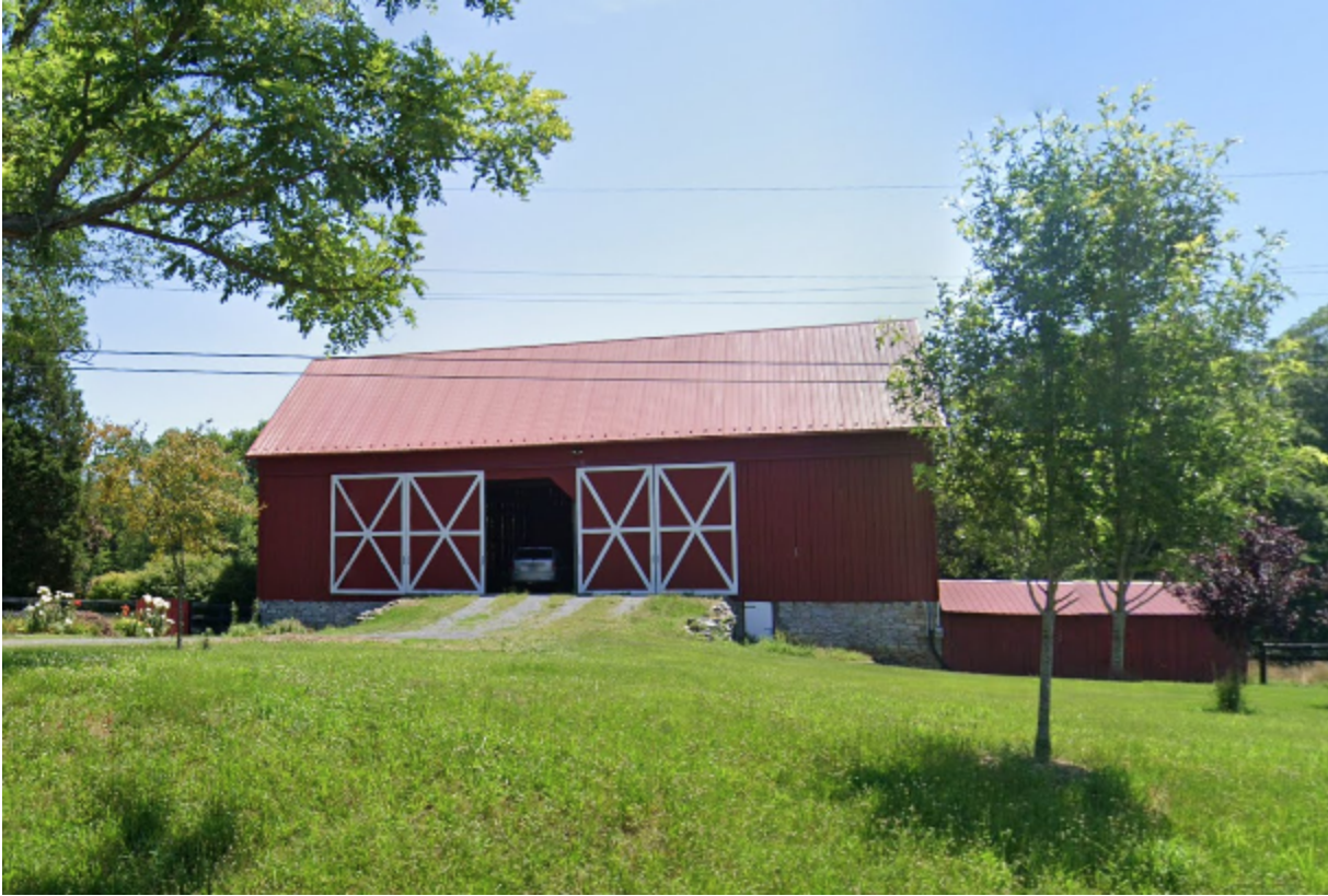
Barn at Shenandoah Oaks.